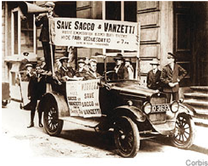
London protesters announce a rally to decry the death sentences of Sacco and Vanzetti.